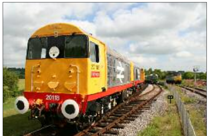
20 118 and 20 227 at Totnes during the 2006 Gala