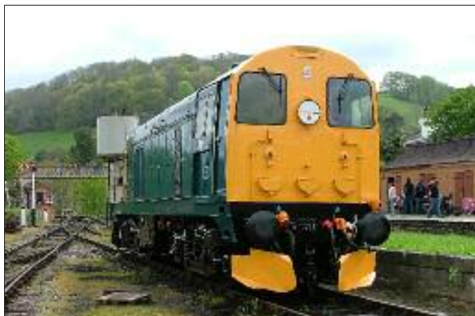
8110 stands in the yard during a 2005 Thomas Event Phil Seymour