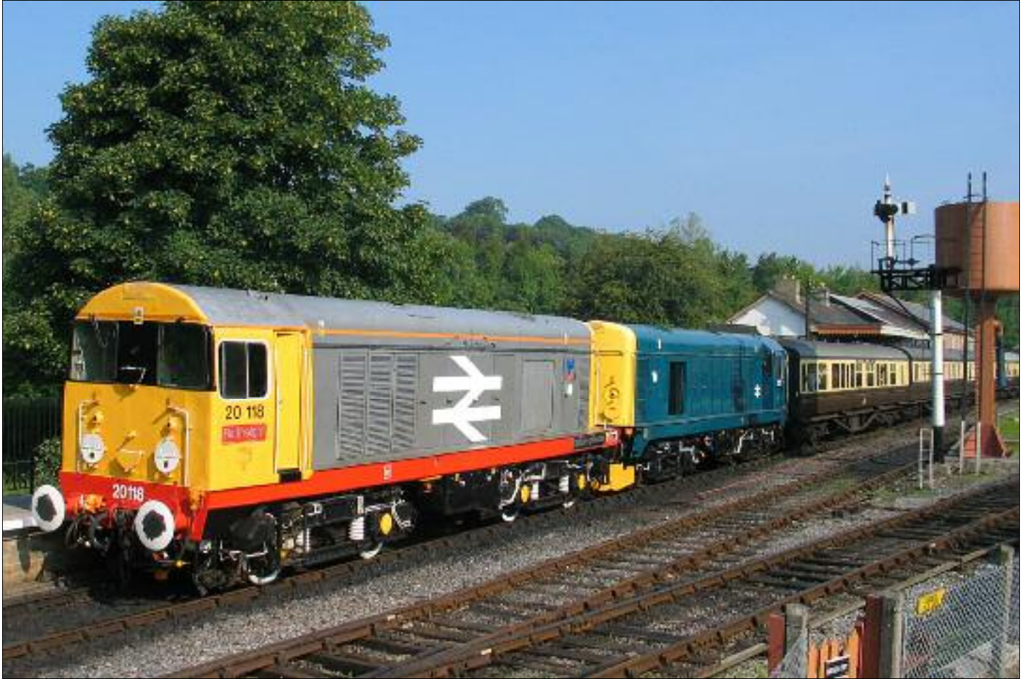
20 118 and 20 110 await departure time at Buckfastleigh during the 2007 Diesel Gala 10 th June 2007

20 118 continues to perform very well and recent maintenance work has been limited to routine servicing as required.