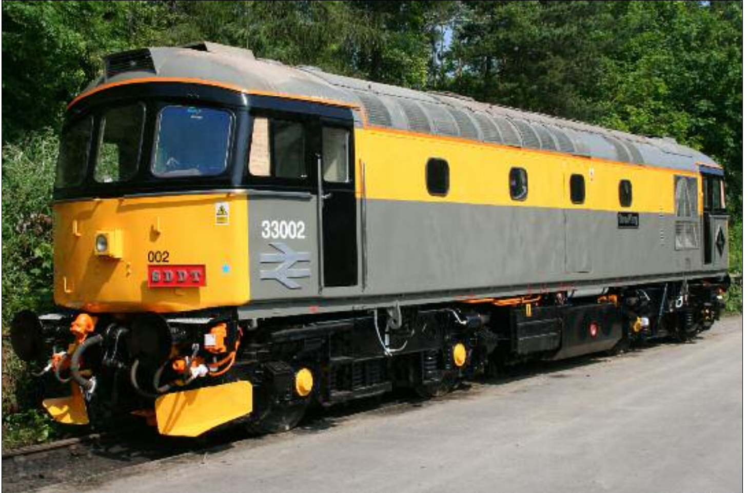
33 002 "Sea King" ex works in 'Dutch' Livery outside the PLOG Shed at Buckfastleigh 10 th June 2007

I was looking through some photos trying to find something appropriate to open Issue No. 26 with and I think that the following fits the bill nicely and represents what we are all trying to achieve and enjoy within the SDDT. From scrap yard to showcase condition thanks to the very hard efforts and skills of teamwork and all involved: