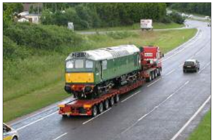
D7612 descends Haldon Hill on the outskirts of Exeter approaching the M5 on its way to Kent 3 rd July 2007