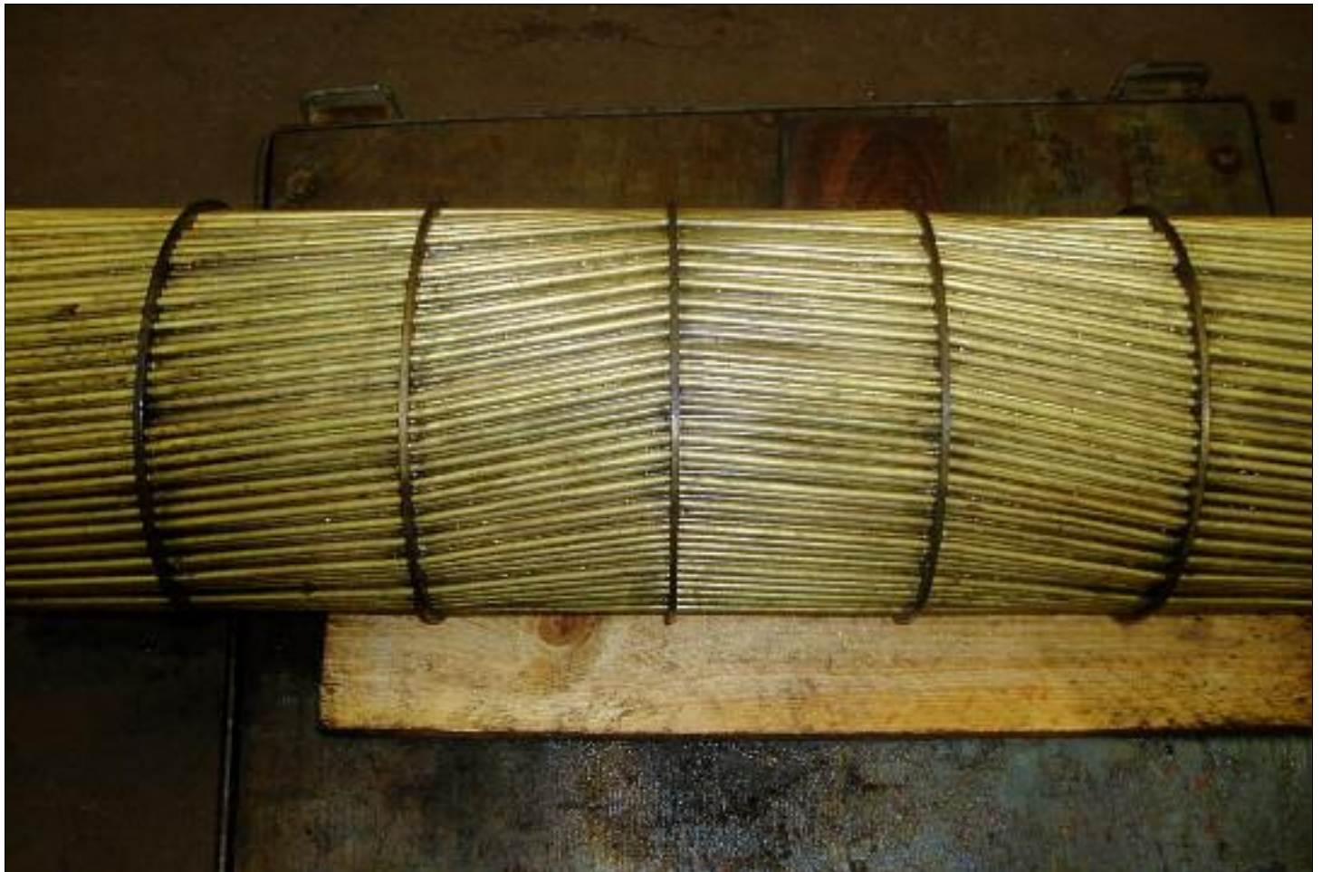
33 002’s stripped down heat exchanger showing the frost damage distortion to the internal tubes June 2007

No 1 Cylinder Head was lifted off the engine block and a replacement transition seal fitted over the weekend of the 28 th /29 th July and all of the cooling system and pipe work reconnected. Several sheared off bolts on the heat exchanger have also been repaired and replaced. A water pressure test was carried out on Sunday 29 th July and a healthy 30 p.s.i reached without any signs of leaks. Hopefully now that the engine block is water tight, we are all a step nearer to a start up. There is plenty more to be done before this can happen though, many hands make much lighter work of the tasks.