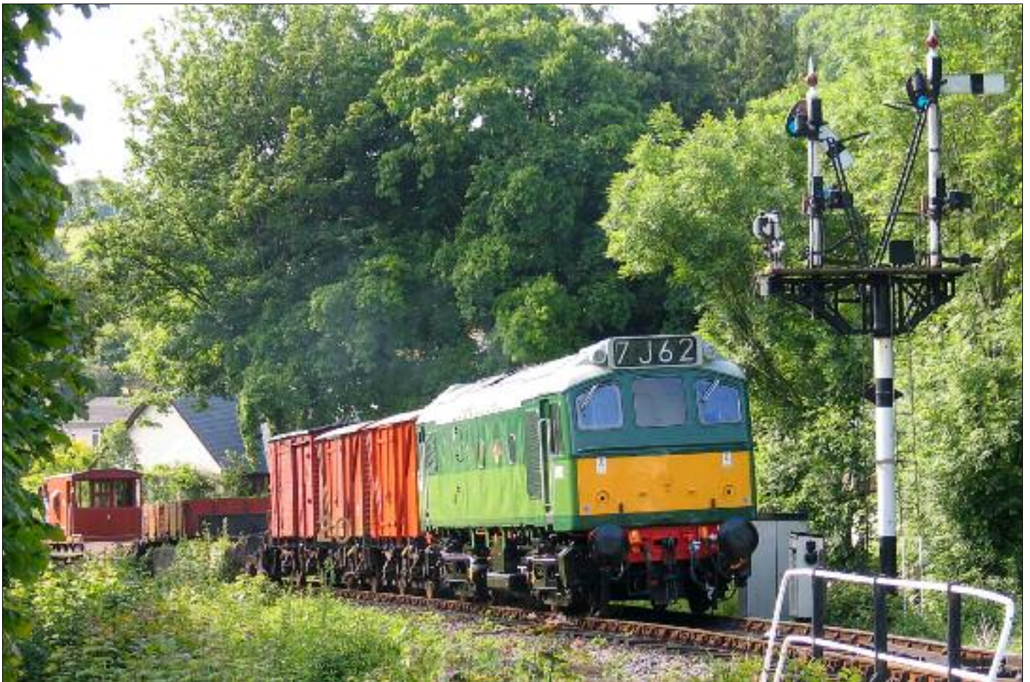
D7612 arrives at Buckfastleigh with the morning Freight 9 th June 2007