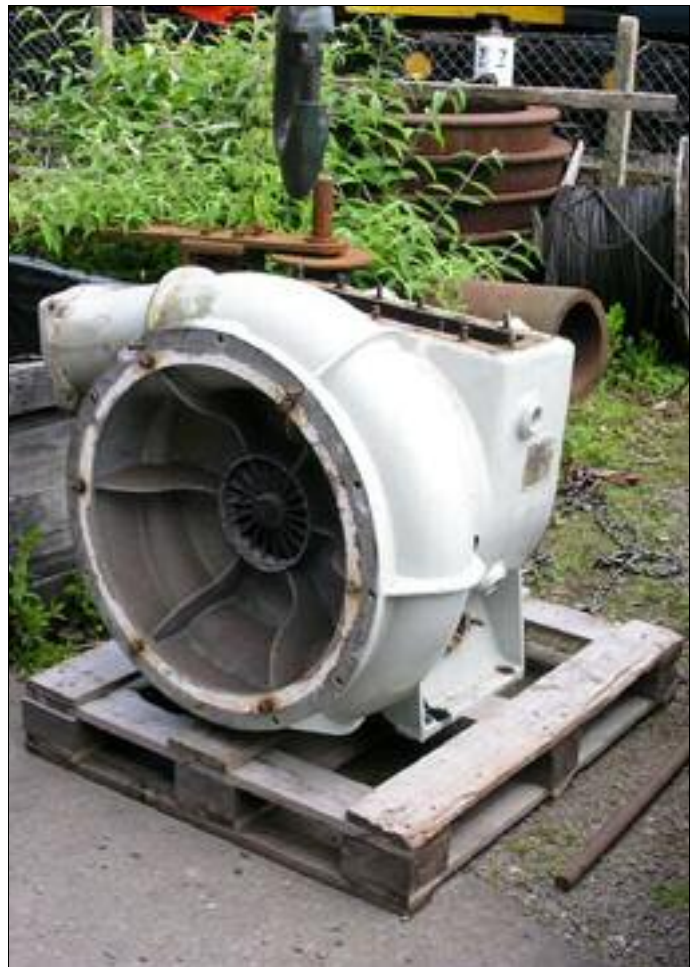
33 002's turbo has been craned out of the loco and dispatched for assessment / overhaul to a company near Barrow Hill Pete Burrow