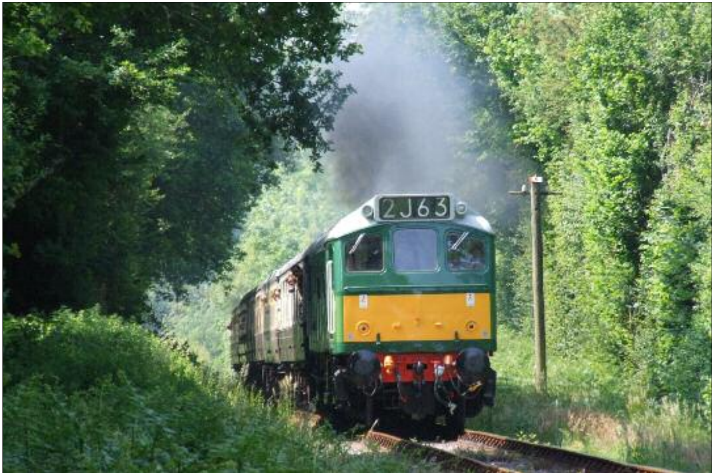
D7612 powers up the Royal Mile approaching the Water Works crossing 9 th June 2007

The 25 has been hired by our friends at the South East Loco Group (SELG) and is currently based on the Spa Valley Railway. The 25 departed from Buckfastleigh by road on the back of a Heanor lorry on Tuesday 3 rd July arriving at Tunbridge Wells on Wednesday 4 th July. The 'Rat' will be used on the scenic line for various Gala's, driving experiences and specials including the "Rat" Real Ale Trains throughout the summer. D7612's next working will be the 3 day August Diesel Gala from Friday 3 rd – Sunday 5 th August 2007. Photos from this event will be posted on the SDDT Website. It will be interesting to see how the Type 2 copes with the 'Bank' on the Spa Valley in comparison to 20 118 last year. The loco is expected to be back in time for our "Gronk Aid 4" Gala in November.