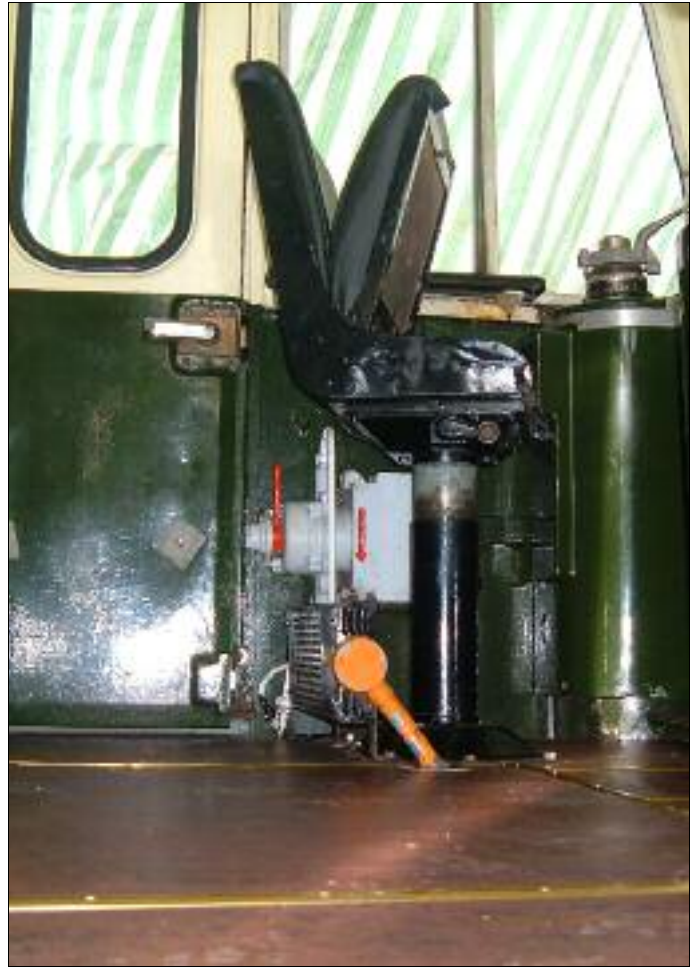
D7612's cab floors have been renewed using plywood covered with brown lino and finished off with brass trim Chris Rees / Phil Seymour