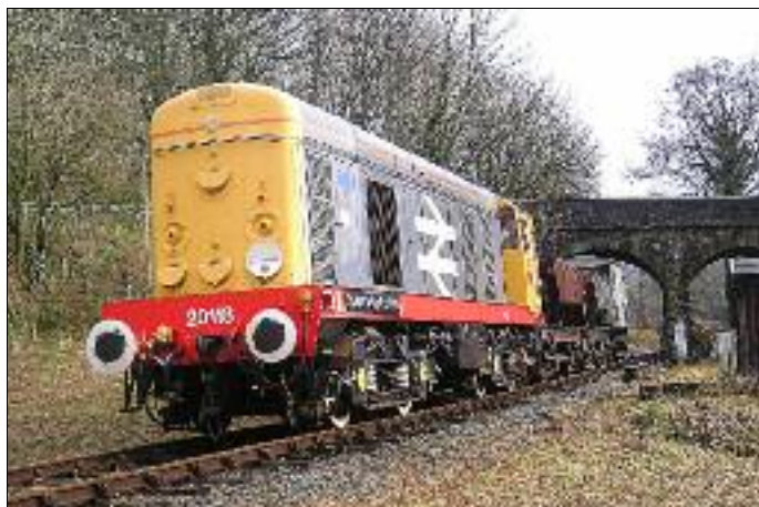
20 118 on a ballast working at Hood Bridge in 2006