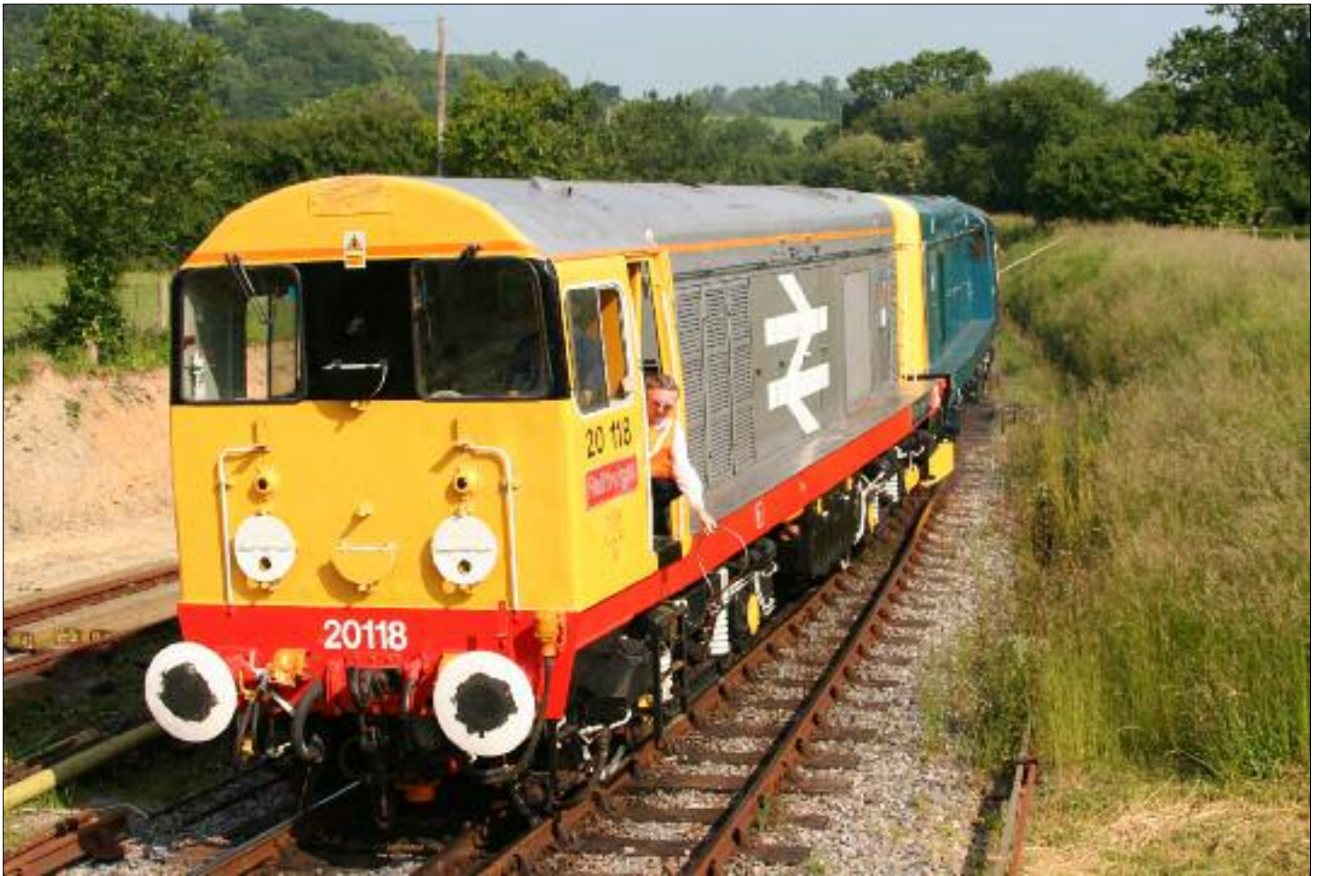
20 118 and 20 110 working in multiple arrive at Totnes Littlehempston 10 th June 2007