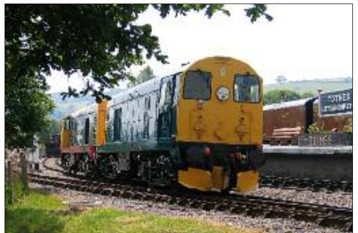
20 110 and 20 118 at Totnes awaiting the next turn Richard Bruford