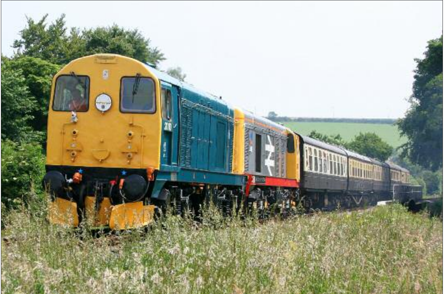
20 110 and 20 118 in Multiple power away from Nursery Pool Bridge 9 th June 2007

20 110 continues to perform very well and recent maintenance work has been limited to routine servicing as required.