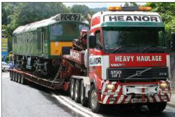
D7612 departs from Buckfastleigh and heads off east on it's visit to the Spa Valley Railway 3 rd July 2007