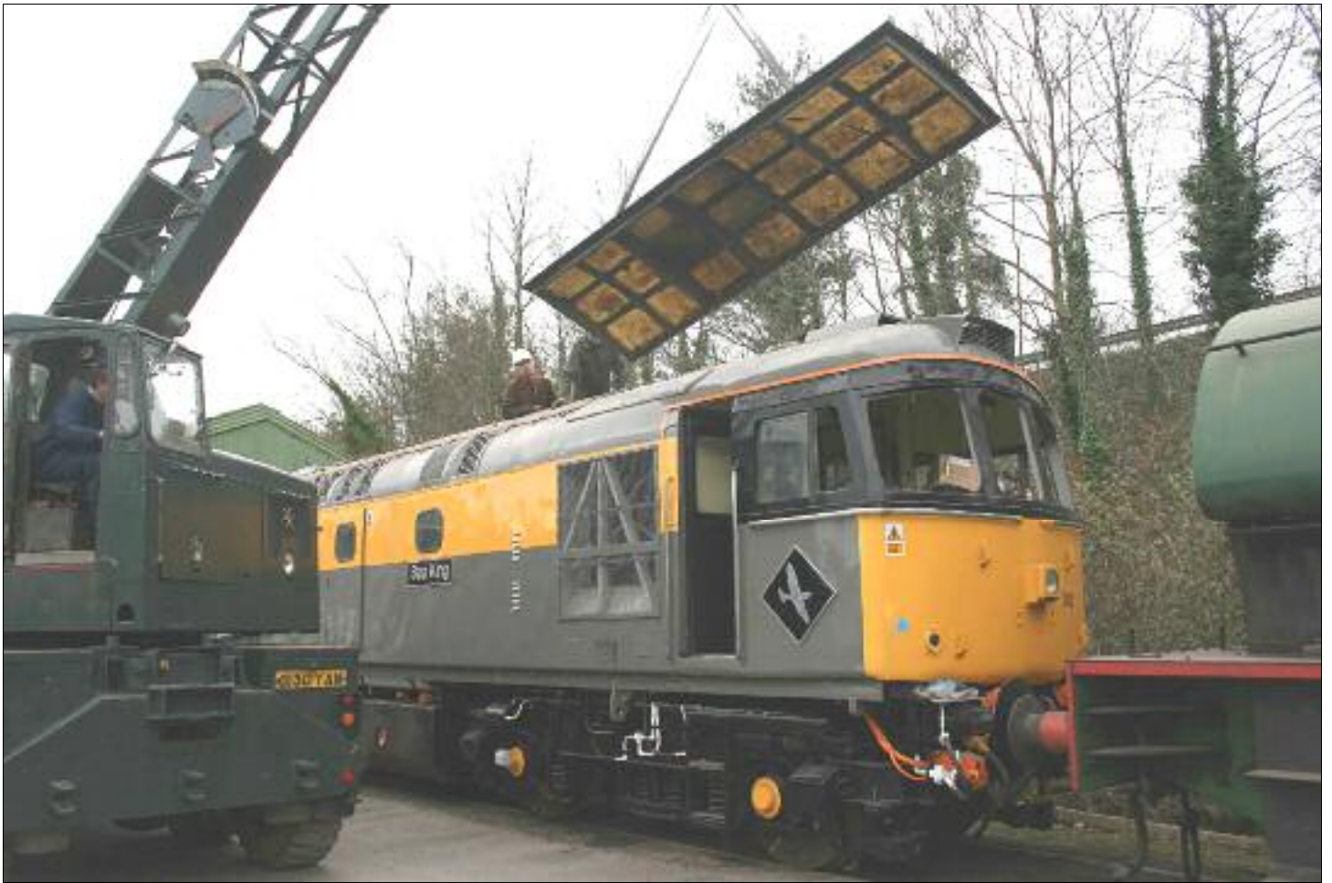
33 002's main fibreglass roof section is lifted off prior to the cleaned up liners being craned back in